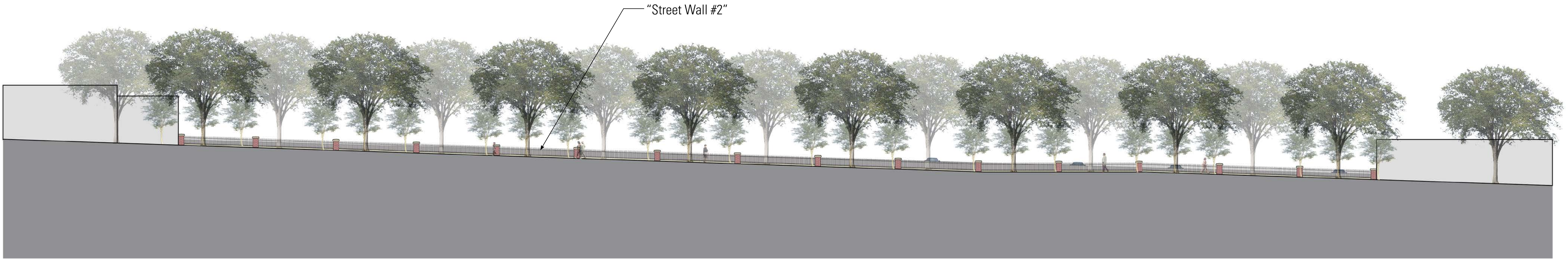
Street Wall Elevation - Progress Avenue